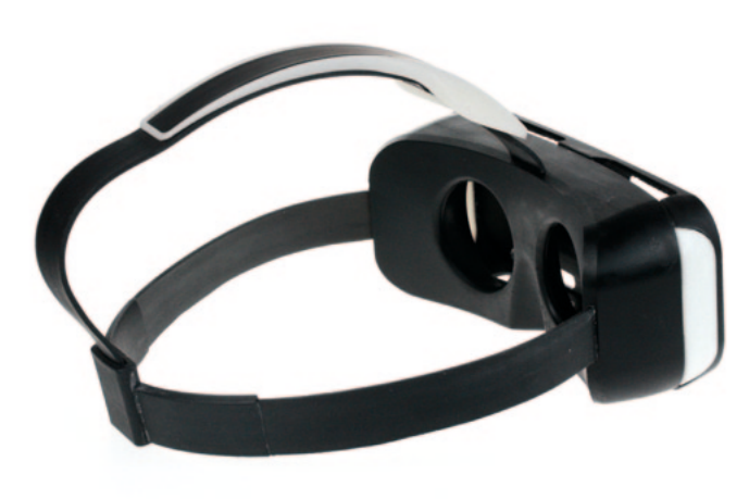
Different views of the prototype produced with Invicta DL380 in O29X 3D printer.