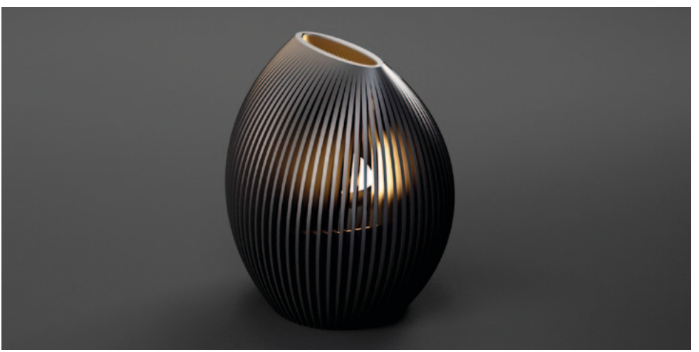
Alux's surface and details obtained with resin DL380 and produced in XPRO Q 3D printer.