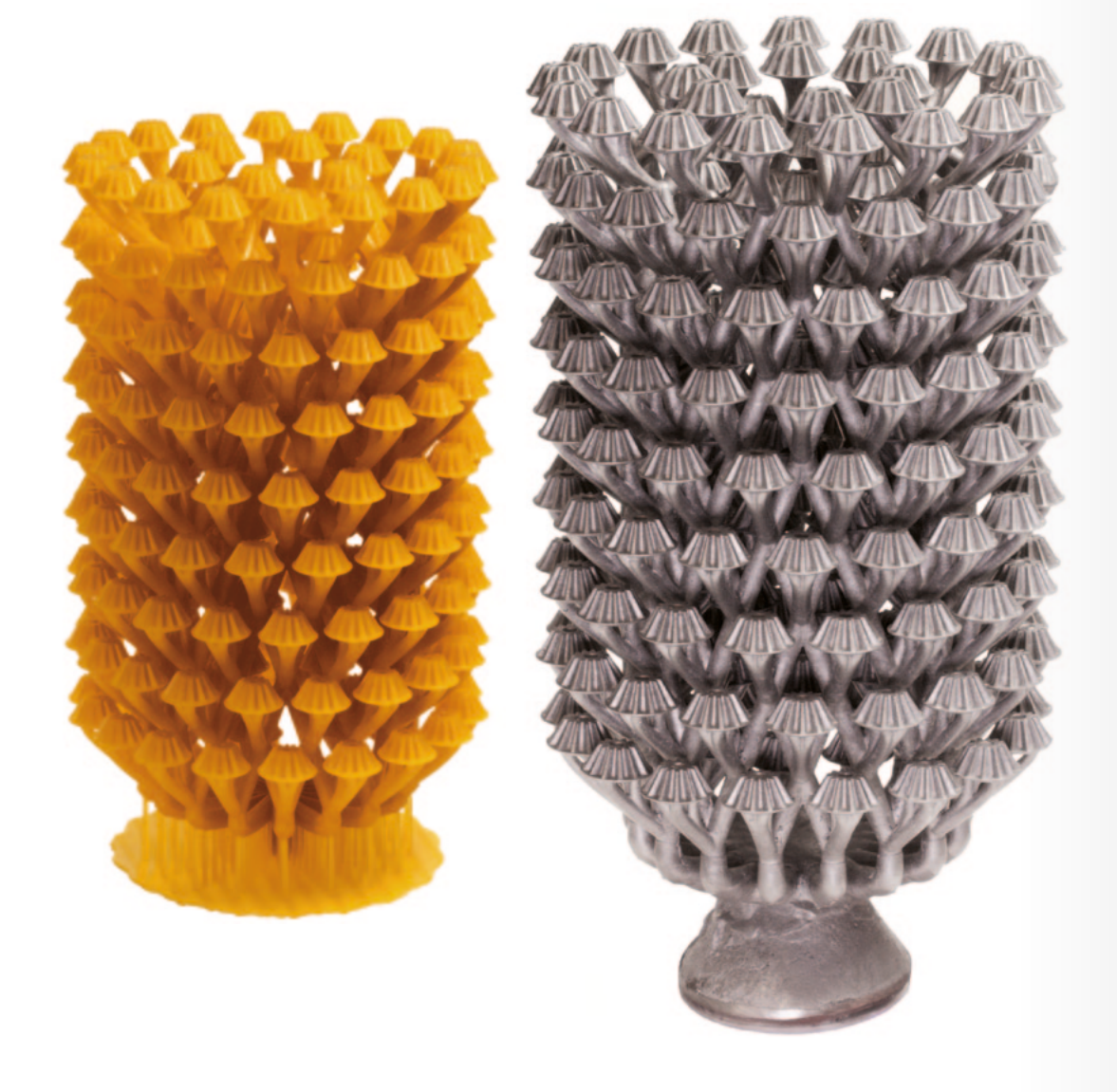
Castable models for industrial use made with DWS 3D printers and materials can be of refined and complex design.