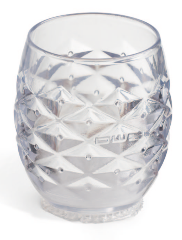
Strong and transparent like glass. An example of the possibilities offered by the combined use of DWS systems and materials.